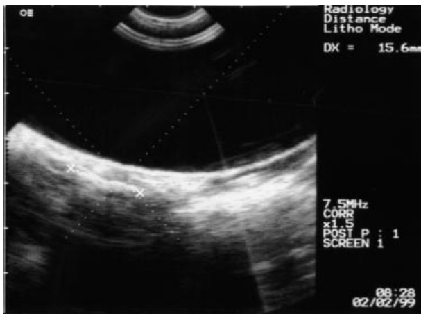
Fig. 1. Localizing a Peyronie's plaque using ultrasonography before treatment.

The patients underwent a mean (range) of 3.9 (3–5) treatments of EST with a maximum of 3000 shocks per plaque at a power level of 2–5. The plaque was located using in-line ultrasonography and palpation, and by the patients being able to feel a 'prickling' sensation in the plaque during therapy. The effect of the treatment was assessed subjectively by the patients, by objective evidence from the photographs and penile angle before treatment, and by re-administering the questionnaires.